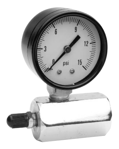
Gas Test Gauge