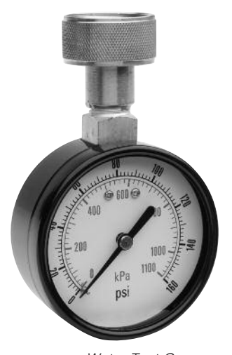
Water Test Gauge