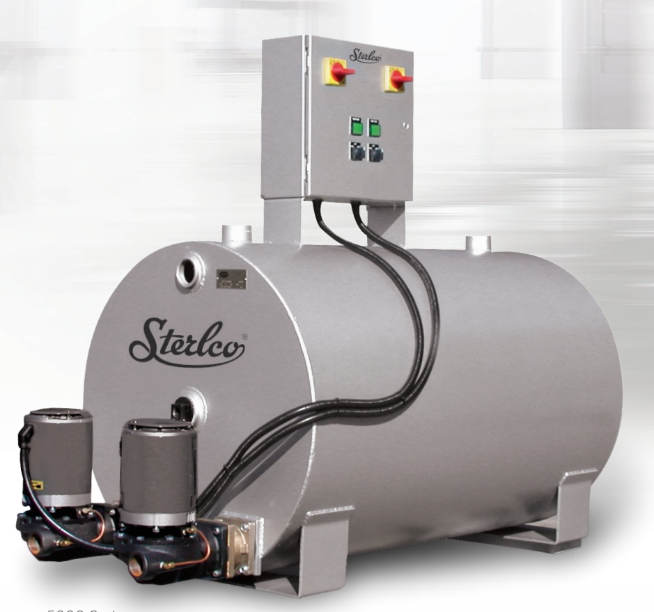
5000 Series Boiler Feed Pumps with Boiler Feed Tank

Every boiler system has its own unique needs. The experts at Sterling are ready to deliver integrated Sterlco® tank solutions designed around the application-specific requirements that our customers expect.