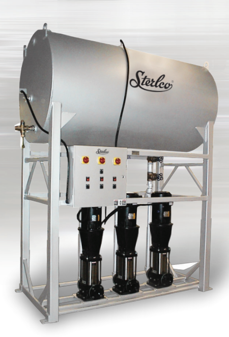
3500 Series High Pressure Boiler Feed Pumps with Boiler Feed Tank