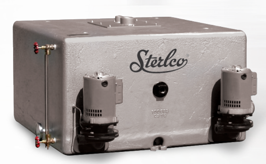
4200 Series Boiler Feed Unit