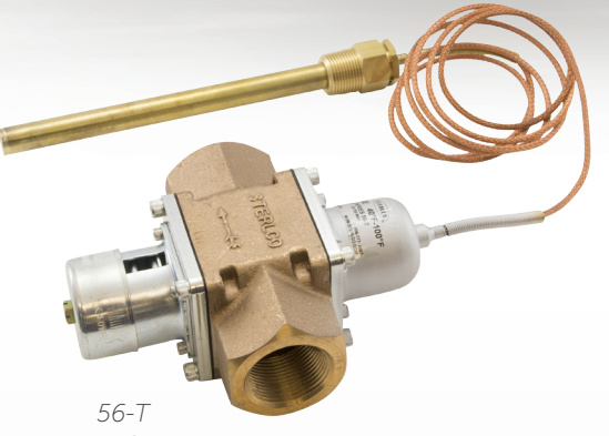
150 Series Temperature Control Valve