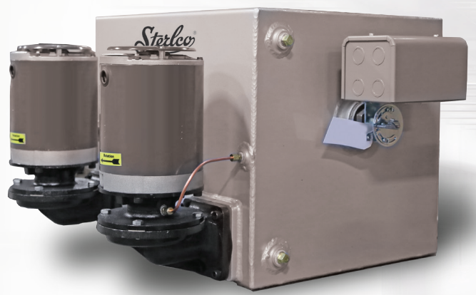
4100 Series Condensate Unit

With a wide range of boiler feed and condensate return systems, Sterlco® units are uniquely positioned to support your needs. Designed for ease of installation and service, Sterlco® steam control pump systems also offer long life and economical operation.