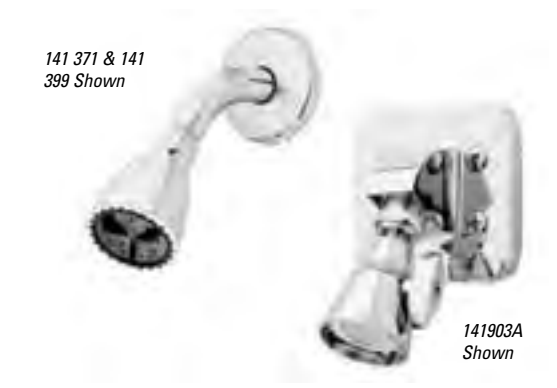
Showerheads are available in four models: deluxe chrome-plated brass, standard chrome-plated brass, adjustable massage, and economizer chrome-plated ABS. Arm and flange options include standard and deluxe chrome plated brass.